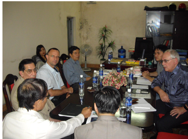
Technical discussions at a Haiphong salt producer's site

Vietnam has a great potential for Swiss made products.