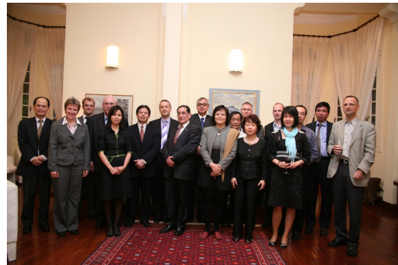
Reception at the Swiss embassy in Hanoi

The organizers aim to have a practical BtoB field trip was fulfilled and the feedback from participating companies was very positive. In two cases potential projects were discussed in details and in another case the organizers were able to arrange staff hiring interviews. Already now it can be said that the participating companies have come across business potential that positively influences their further decision making for the market development in Vietnam.