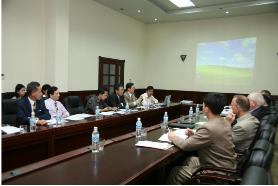
Warm welcome at the MOIT in Hanoi

In order to enable specific business talks and have the opportunities for business development the organizers have divided the delegation from time to time in order to fulfil individual demands.